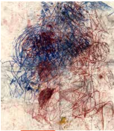
Oscar Murillo's Untitled (Drawings off the wall), 2011, commanded $401,000, four times its high estimate, at Phillips in September 2013.