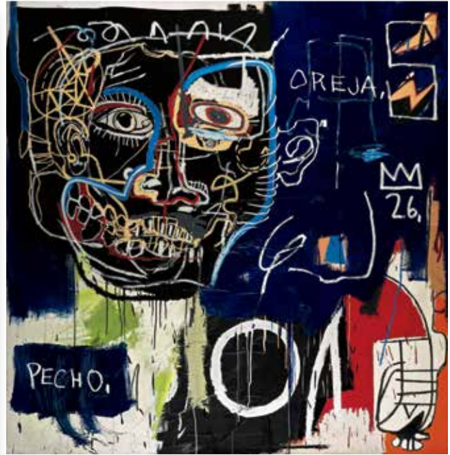
Basquiat's Untitled (Pecho/Oreja) , 1982-83, sold for $10.1 million at Sotheby's London in 2008. The same work changed hands again at the house for $10.7 million five years later.