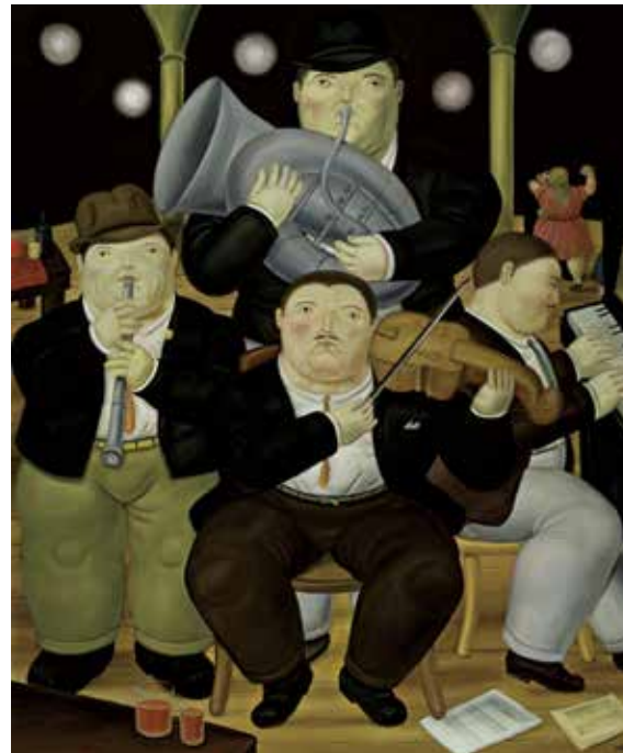
From left, Roberto Matta's La révolte des contraires , 1944, achieved $5 million at Christie's New York in 2012, while Fernando Botero's Cuatro Músicos , 1984, crescendoed past $2 million at Sotheby's New York on May 24, 2006, matching the record for the artist's The Musicians , 1979, set the previous day at Christie's.